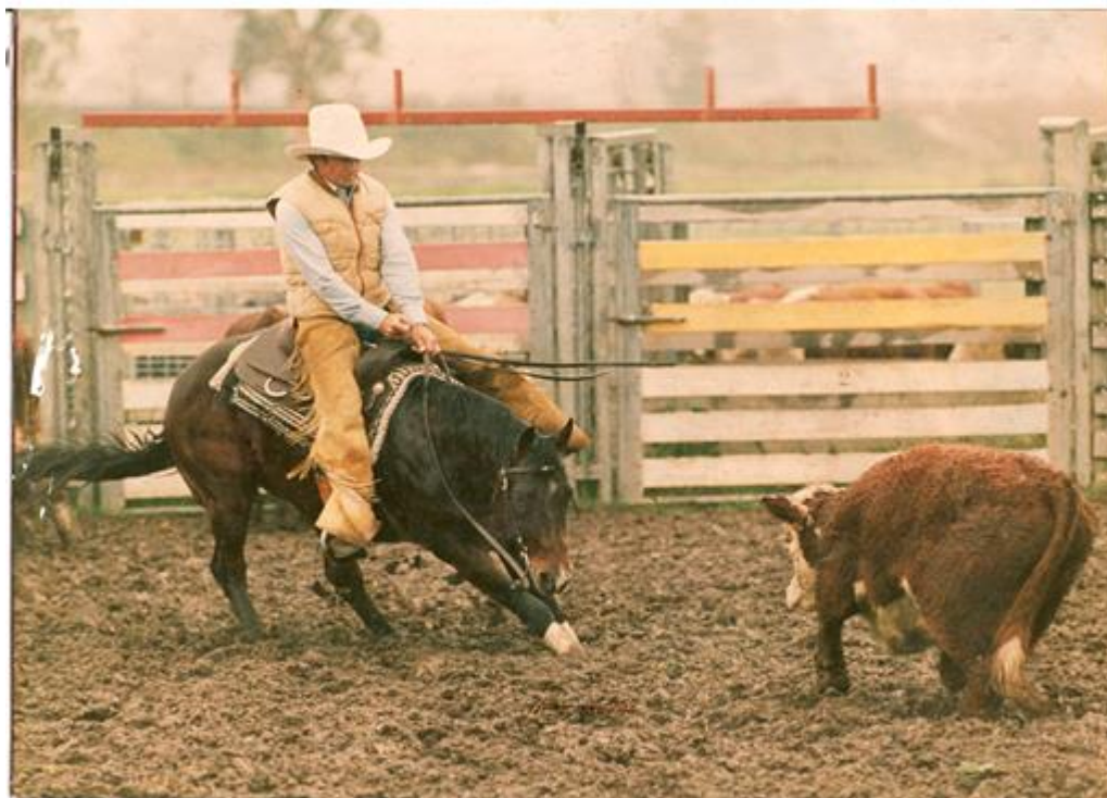
LITTLE PEPPY DOC CUTTING

the stirrup and eventually would get it caught in his mouth. Did he go berserk? No – he would stand there and cry for someone to come and take it out. Did it stop him playing with it? No – we had to tie the irons on top of the saddle if he was tied on the walker. He did not like to get too tired, and you would lope him around the large front paddock two or three times before he worked cattle, and after the first 100 meters you would have to kick him the whole way round as he was “tired” – tired until, of course, he was put in front of a cow, and then he just loved to play! He was truly a unique individual.