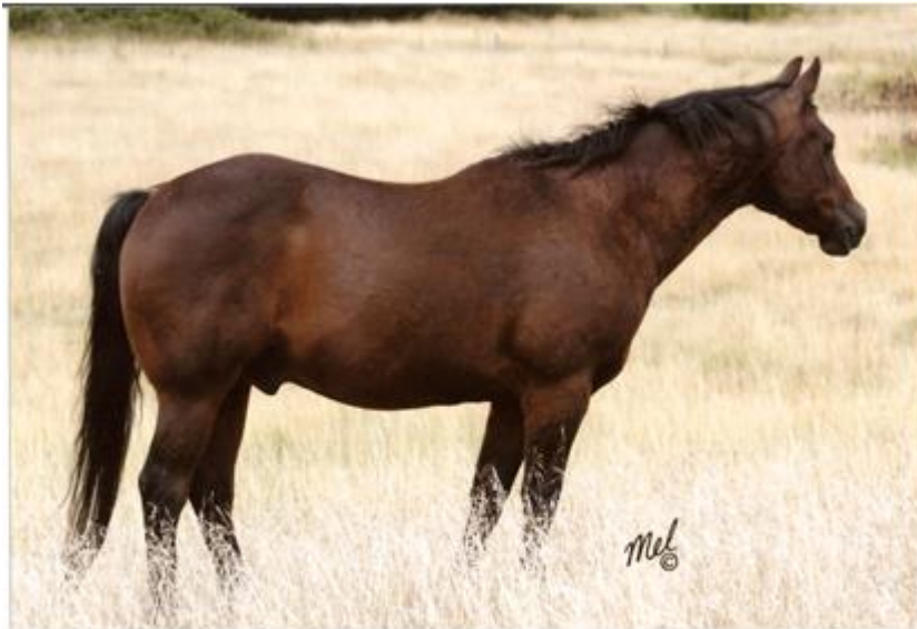
LITTLE PEPPY DOC 2009