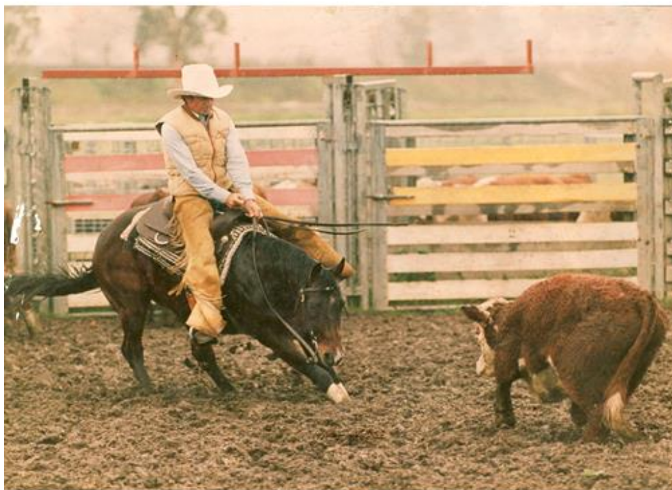
Photo:- LITTLE PEPPY DOC cutting