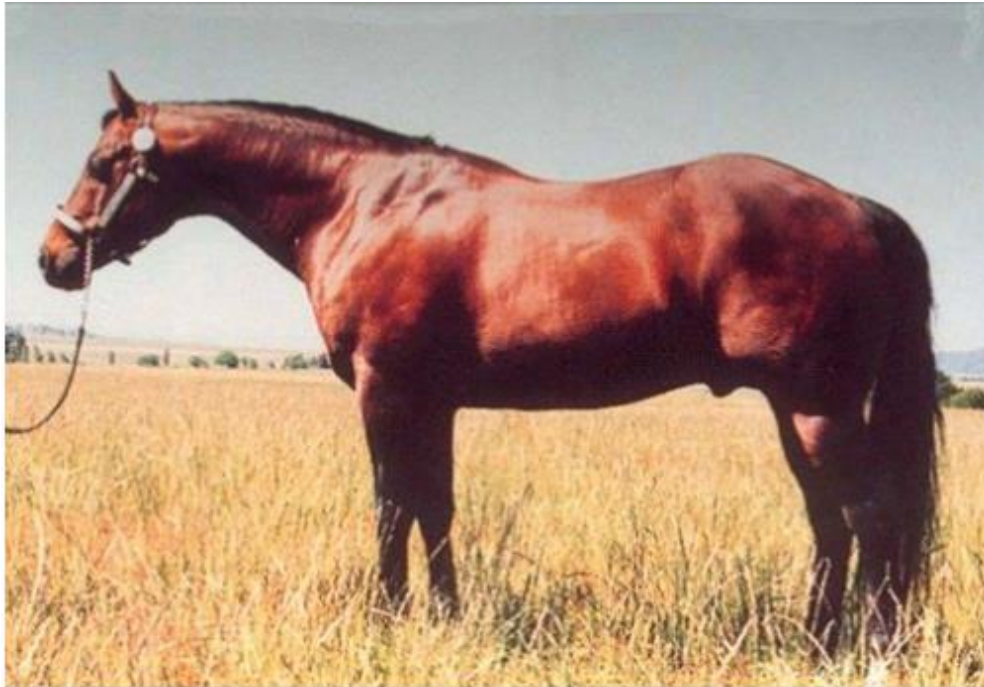
Photo:- LITTLE PEPPY DOC Q-5786

was an AQHA and NCHA Superior Cutting Horse who sired many AQHA and NCHA high point award winners and produced as many as fourteen AQHA Champions, eight AQHA Champion Youth Horses and six AQHA Amateur owner Champion Horses. He was also the sire of WINDERADEEN PEPPYCOSE Q-17365 and GOLDEN PEPPER Q-19304, who are arguably two of the greatest amateur owner horses.