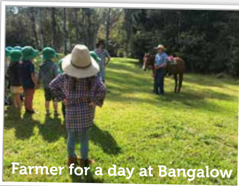
Farmer for a day at Bangalow

Ooranga was contacted in August by staff at the Bangalow Community Children's Centre, located near Byron Bay. The preschool children at Bangalow had seen and heard about how communities out west were under stress and they wanted to help, particularly after they had seen photos provided by Ooranga families who were experiencing the drought firsthand.